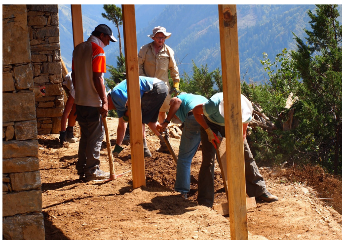
Helping construct the clinic in October 2010