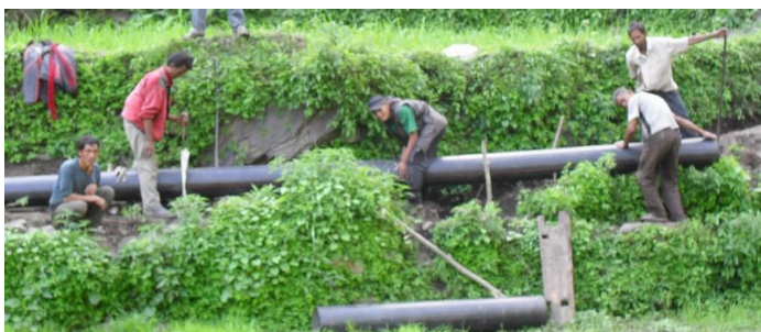
Left: the construction programme in summer 2010

Delivering electricity into a community is an amazingly transformational event. Not only does it provide light in the dark winter months but also allows the introduction of