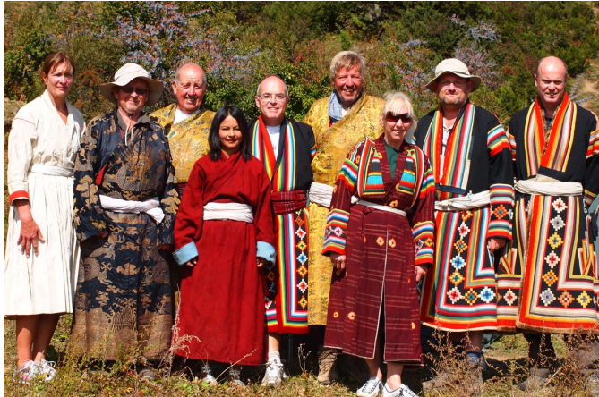
Torpa Volunteer 2010 Trek to Build Team